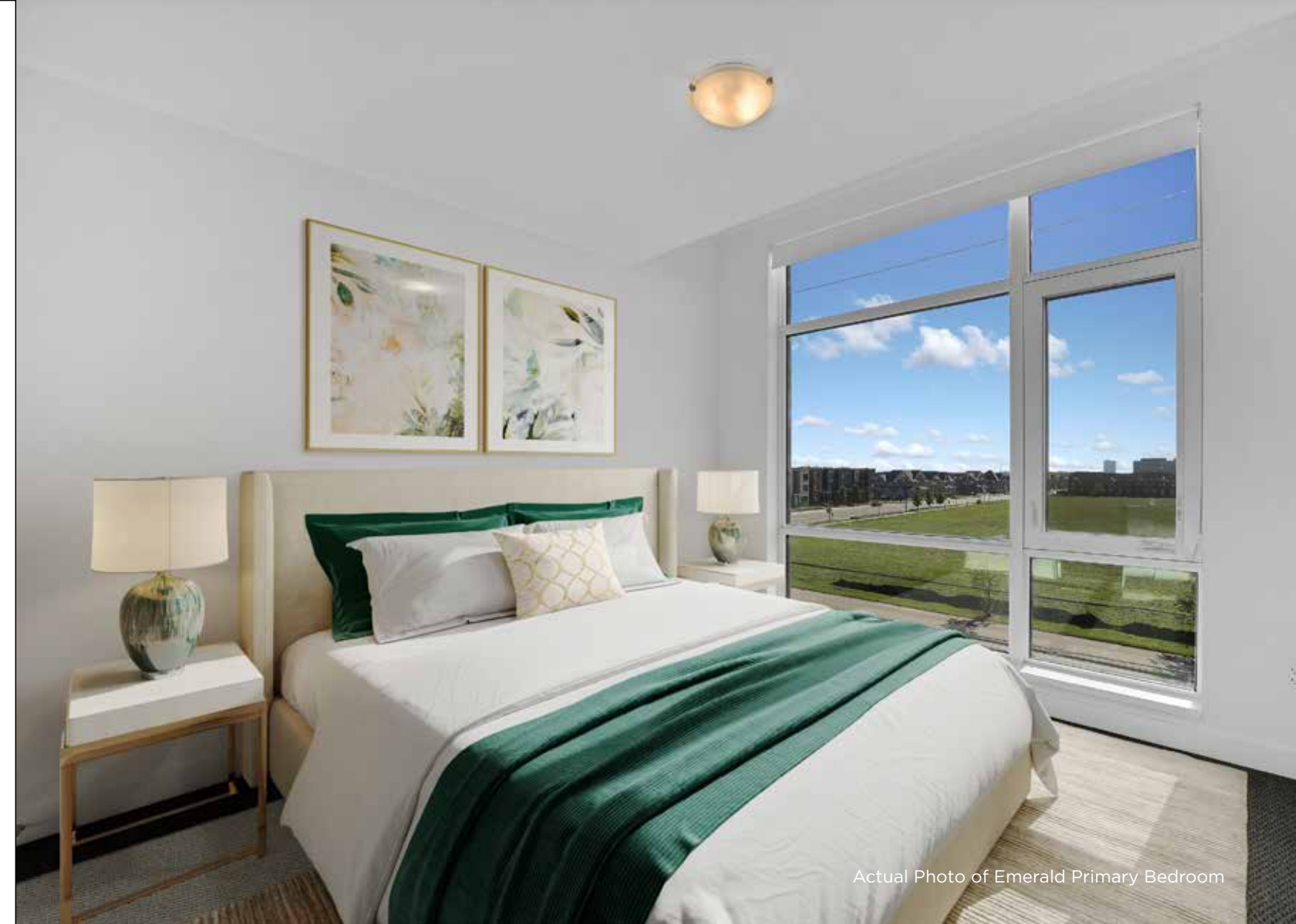
Actual Photo of Emerald Primary Bedroom