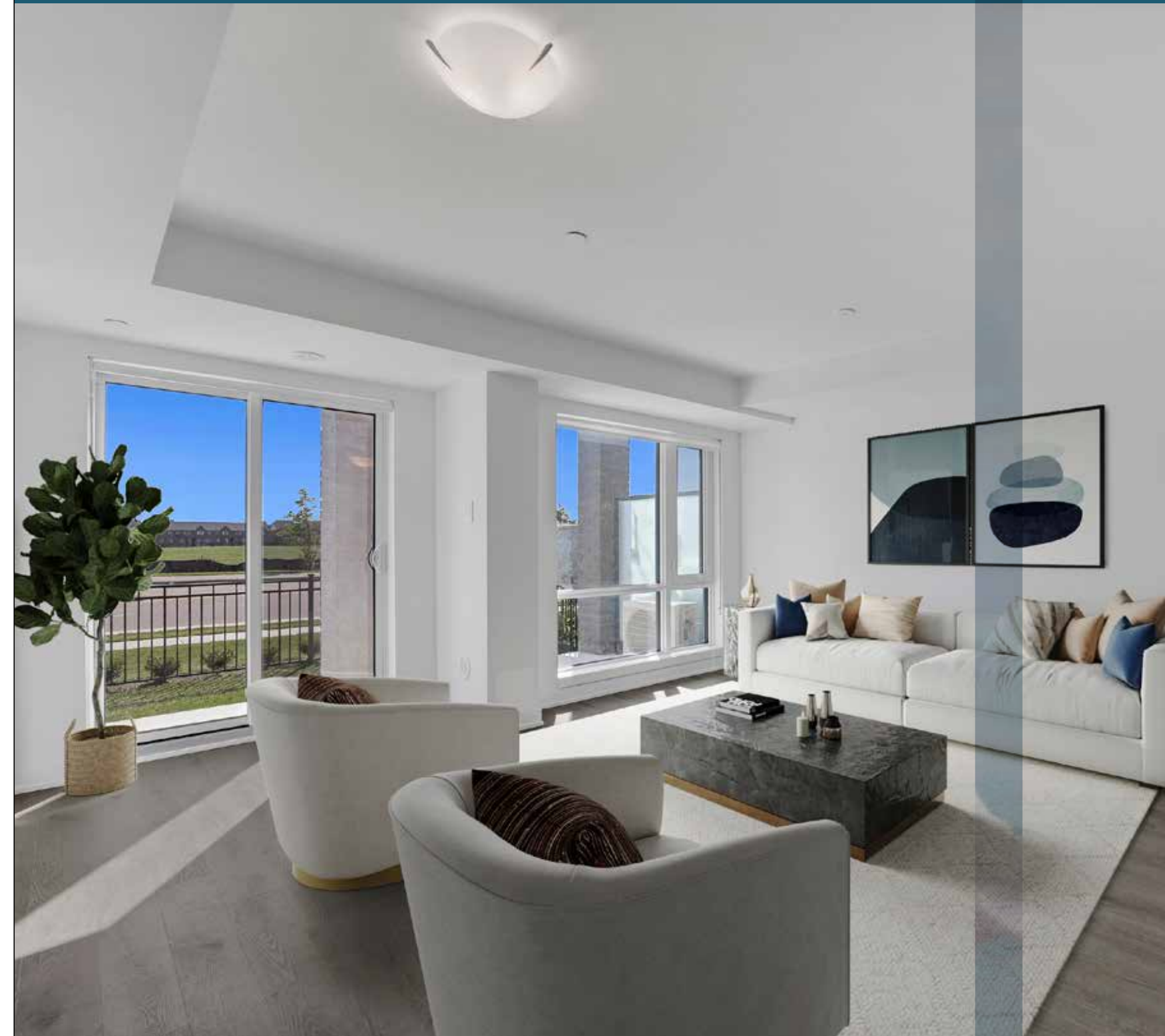
Actual Photo of Diamond Living Room