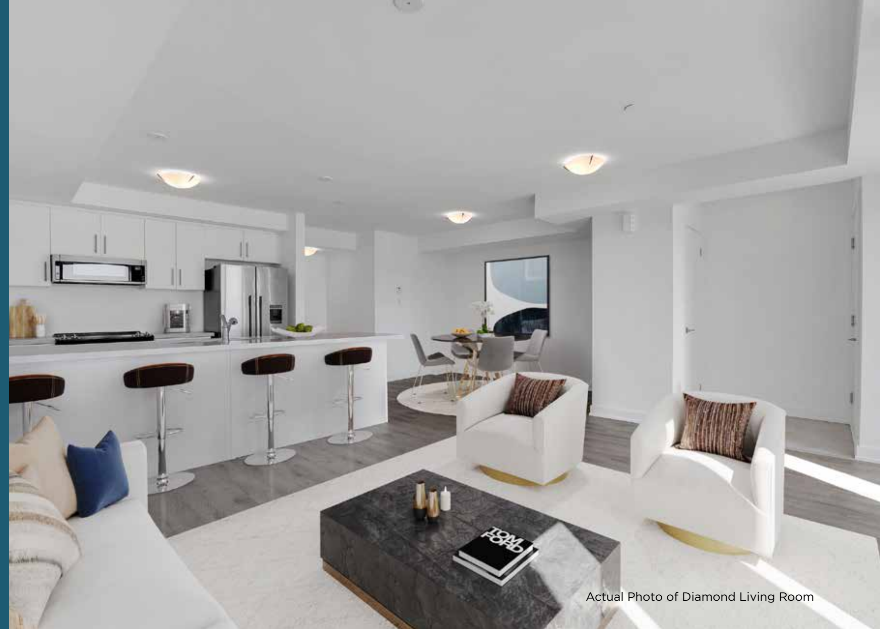
Actual Photo of Diamond Living Room