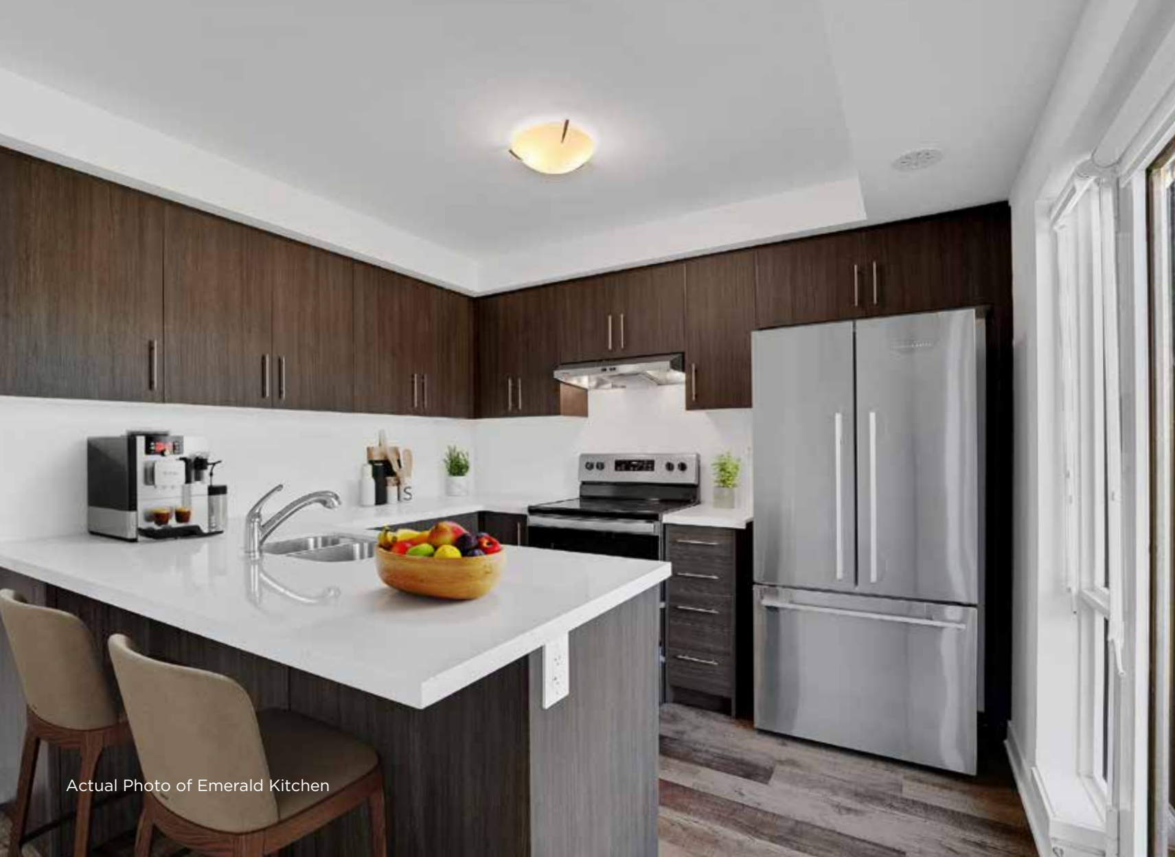
Actual Photo of Emerald Kitchen

Each two- and three-bedroom floorplan has been designed to include all of the conveniences of a townhome while keeping space optimization in mind.